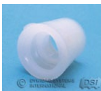
Plastic Spacer Cones B15F86010 B20F86010 B26E86010