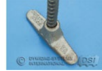
5/8" Welded Neck Flange B15F32610 B20F32620