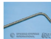
L-Rod B15FLBLT B20FLBLT