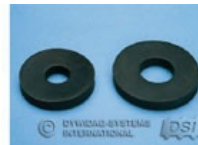
Neoprene Waterstop B15F34500 B20F34500