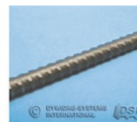
THREADBAR® B15F01910 B20F04910 B26E06010