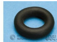
Hydrophilic Waterstop B15F34600 B20F34600