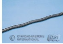
Wobble Anchor B15F52080 B20F52080 B26E52080