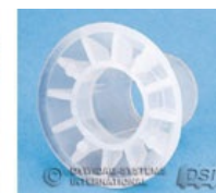
Euro Push Fit Cone B15F87010 B20F87010