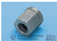
Hex Nut B15F27901 B20F20211