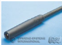
Standard Shebolt B15F37010 B20F37010 B26E37010