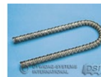
U-Bolt B15FUBLT B20FUBLT