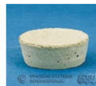
Concrete Plug B15F34110 B20F34110