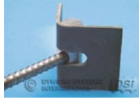
Welded Angle Bracket B15F36110 B20F36110