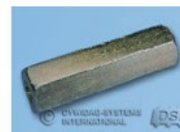
Hex Coupler B15F30510 B20F30510