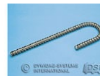
J-Bolt B15FJBLT B20FJBLT