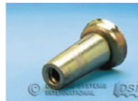
5/8" Shebolt Steel B15F30340 B20F30340