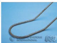
Brace Frame Double Anchor B15F20020 B20F20020