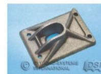
Batter Washer B15F35210 B20F35210 B26E35210