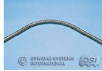
Radiused Anchor B15F20010 B20F20010