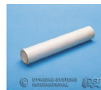
PVC Spacer Sleeve B15F36010 B20F36010 B26E36010