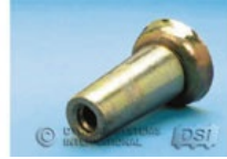
Shebolt Steel Cone B15F30340 B20F30340