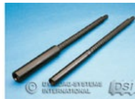
Pass-thru Shebolt B15F38015 B15F38019 B15F38119 B20F38015 B20F38019