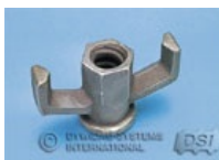
Wing Nut B15F27711 B20F27711 B26E27710