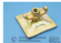
Combination Plate B15F1020