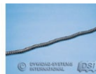
Wobble B15F52080 B20F52080