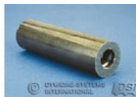
Round Steel Coupler B15F30310 B20F30310 B26E30310