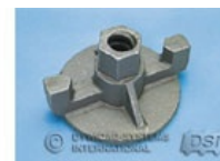
Wing Nut Bracket B15F27210 B15F27220 3 Wings B20F2072