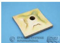
Ribbed Plate B15F26610