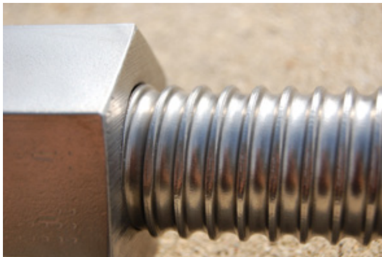
Cold Rolled THREADBAR® with Hexnut